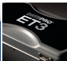
Thermal barrier TB0263*