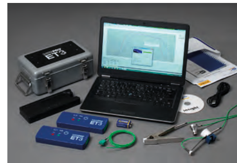
DATAPAQ EasyTrack3 system