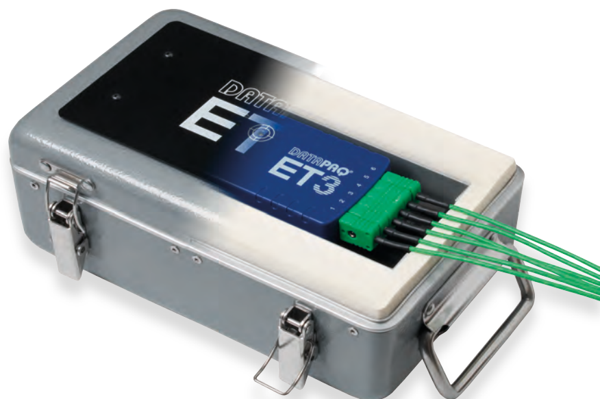
EasyTrack3 system with standard TB0253 thermal barrier