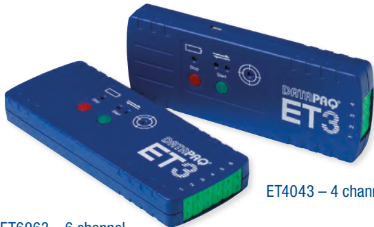
ET6063 – 6 channel